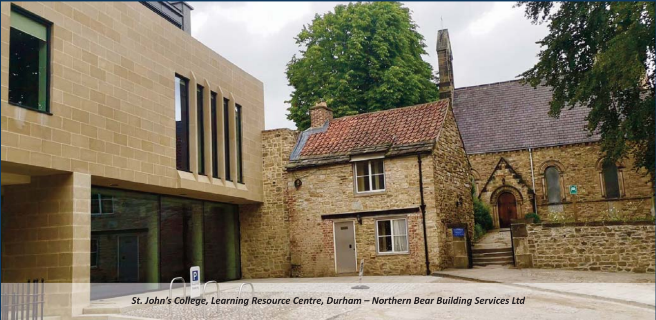
St. John's College, Learning Resource Centre, Durham – Northern Bear Building Services Ltd